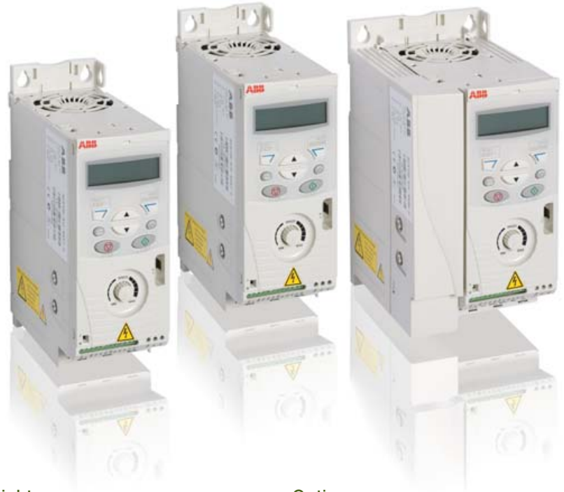
ABB micro drives are designed to be incorporated into a wide variety of machines such as mixers, conveyors, fans or pumps or anywhere where a fixed speed motor needs to run at variable speed.

The ACS150 drives have an integrated user panel and potentiometer, and a variety of features such as macros, which are pre-defined I/O configurations like 3-wire, PID-control and motor potentiometer macro. In addition, the drives offer extensive range of parameters that help obtaining the best performance out of the application.